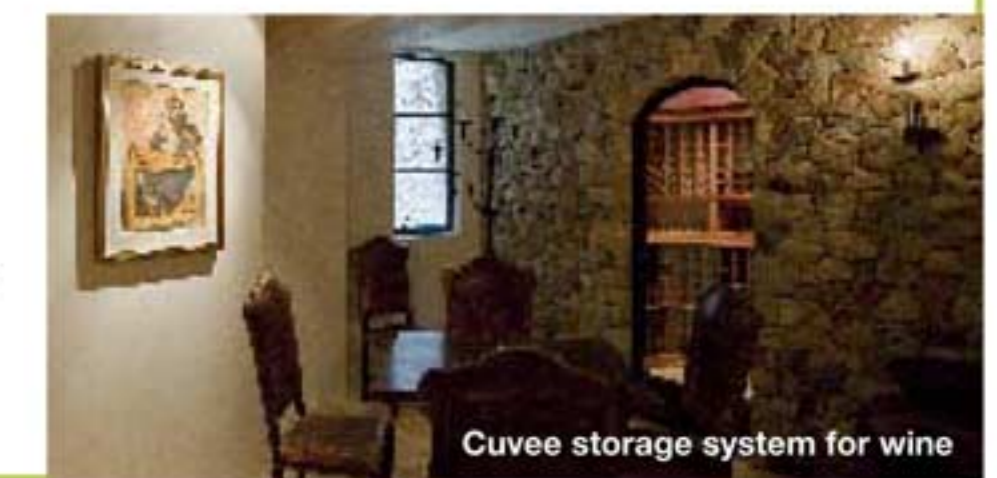
Cuvee storage system for wine

Cuvee Storage System: Cuvee's custom climate control systems for wine cellars are built individually to the tolerances and specifications of each room. Industry standards specify storing wines at 56-58 degrees and 58-72 percent humidity. Changes in both will compromise the wine and