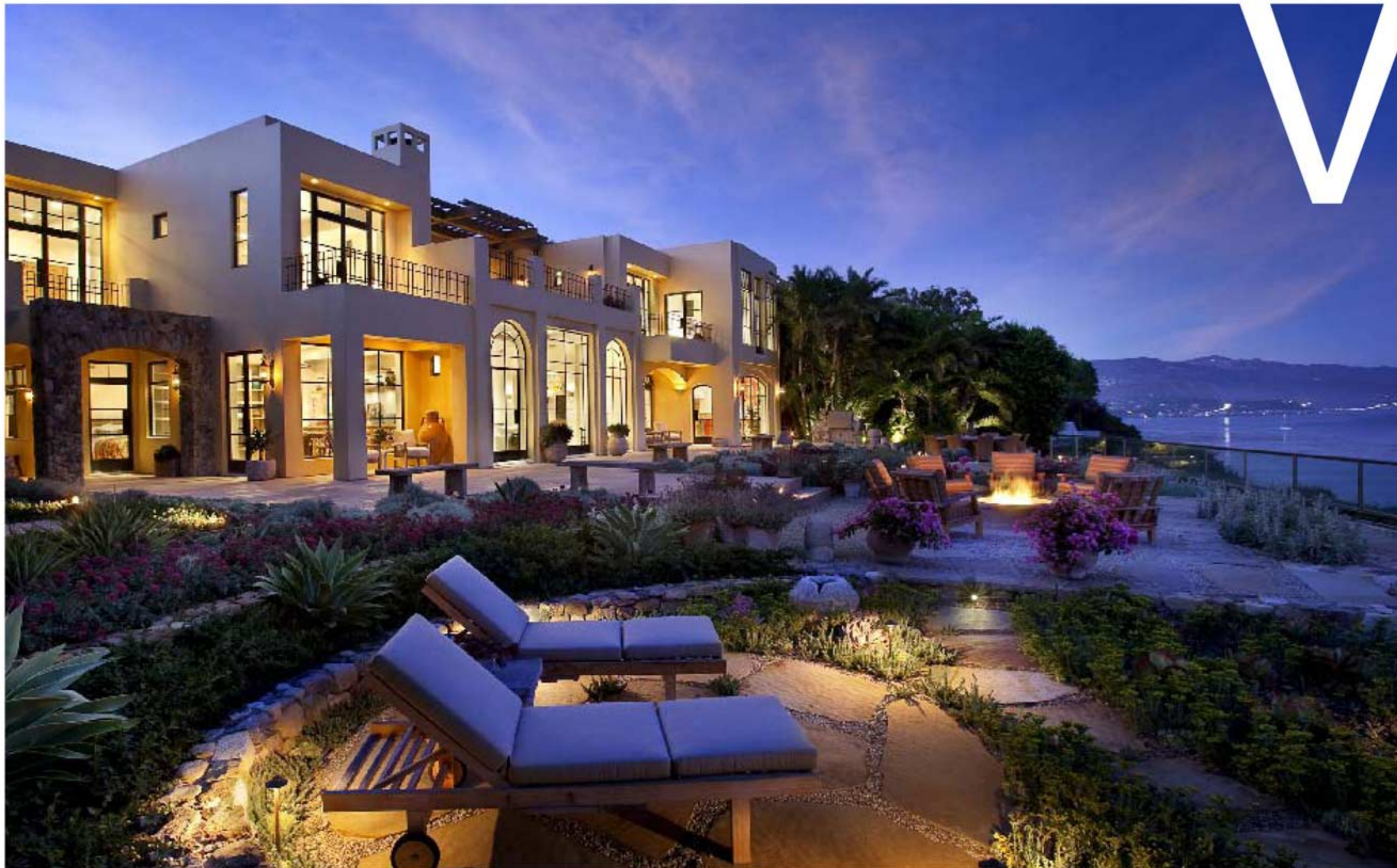
Malibu beach house built by Golenberg & Company