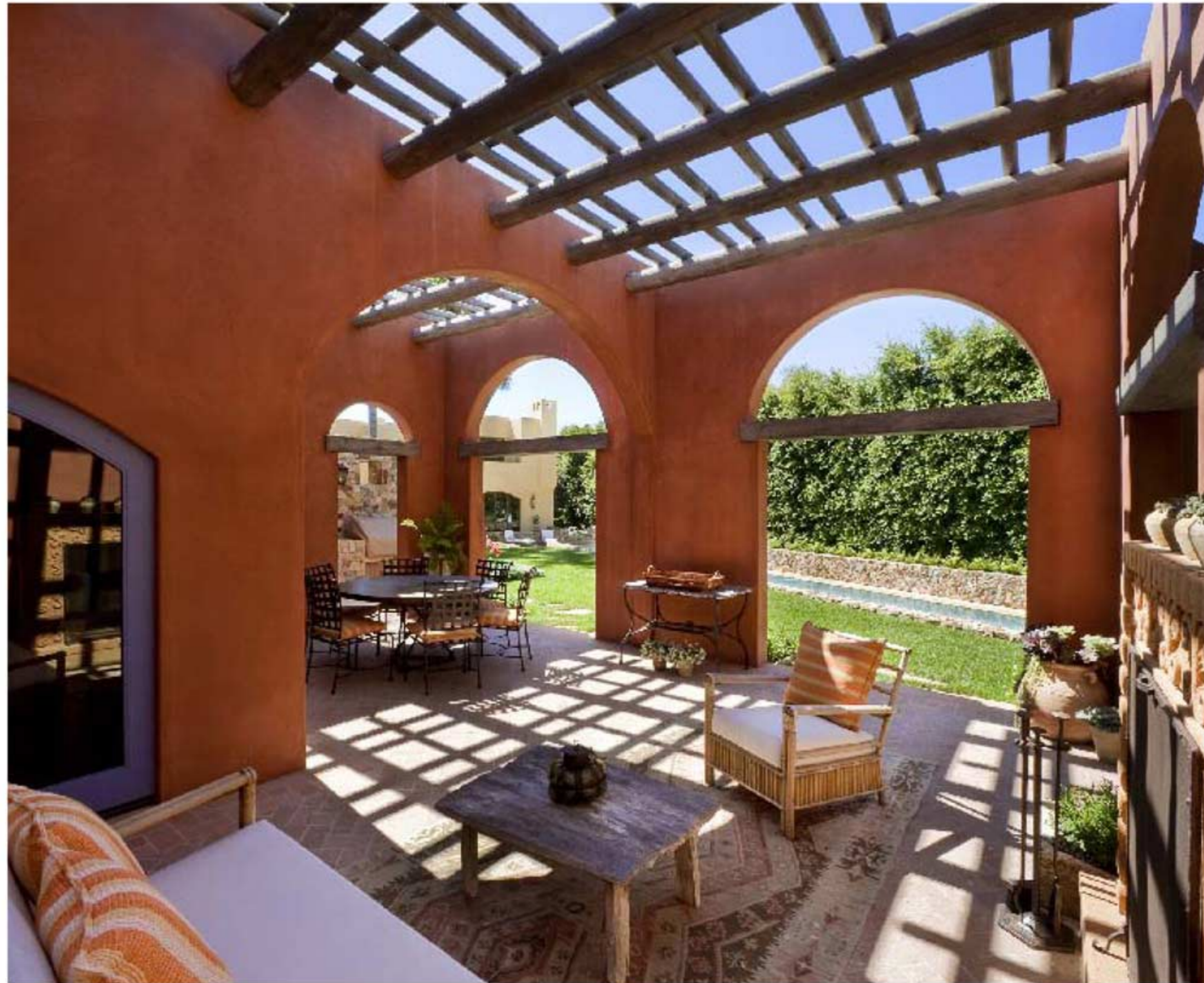
Log and latilla beams and hand-carved Contera stone fireplace distinguish the poolside cabana.

A: "Anything is possible. Working together for years in so many different settings we've built a level of understanding that comes from the experience of solving challenges together. As a team we're committed to getting the smallest details right."