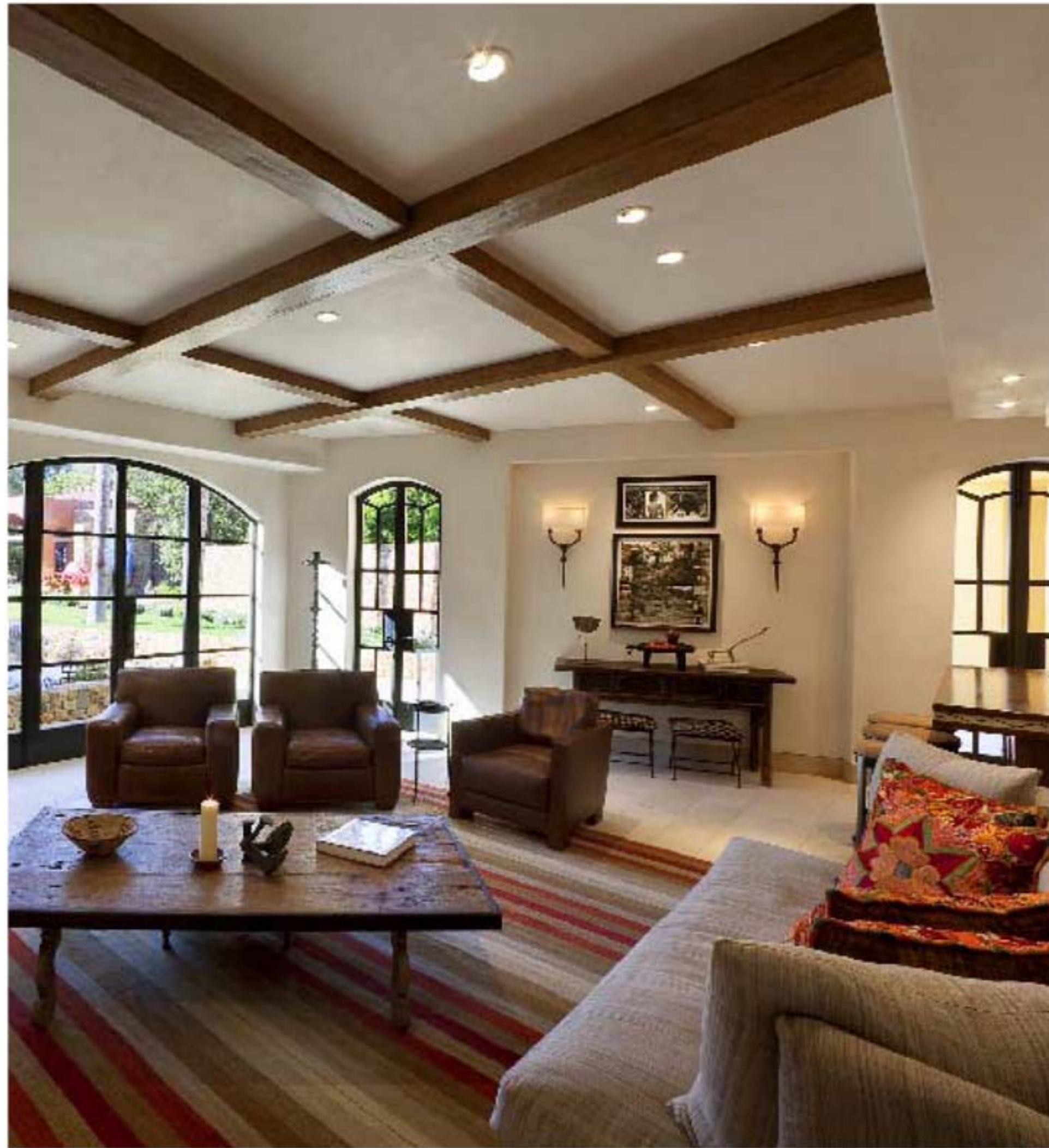
Hand-hewn wood beams, finished on site, complement custom-designed wrought iron lighting and hand-troweled plaster walls.